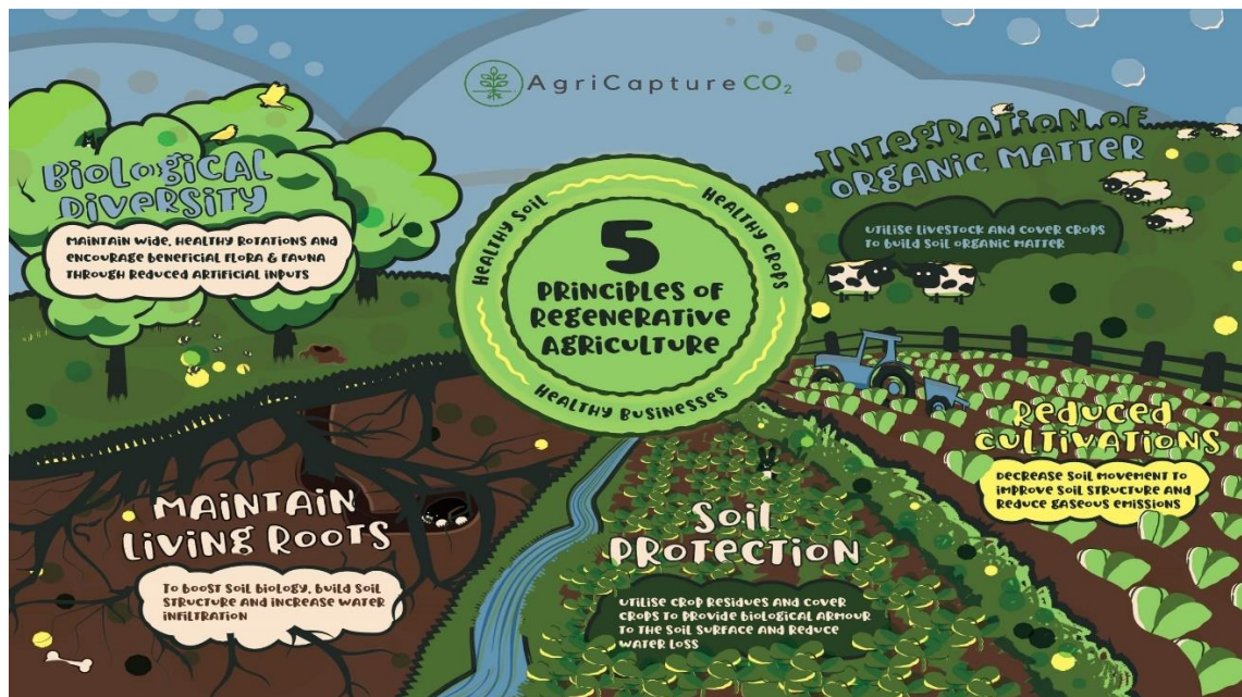
Figure 1: The 5 principles of regenerative agriculture

But it is in the fusion of modern technology, scientific understanding and a rediscovery of the sound agricultural methods of the past that points the way to a sustainable future in regenerative agriculture, building the health and resilience of our soils and wider farm ecosystems, leading to healthier, more resilient crops and ultimately healthier, more resilient and profitable farm businesses. This has never been more imperative than now, as climate change begins to seriously impact agricultural productivity across the globe.